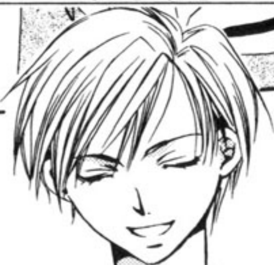
ロサ・フェイテータ 黄薔薇さま 支倉 令