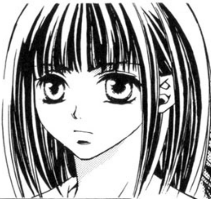
ロサ・ギガンティア・アン・ブットン 白薔薇のつぼみ 二条乃梨子